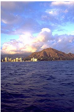
The 2007 ICAASP conference will be held in Honolulu, Hawaii.

The Computational NeuroEngineering Laboratory explores the principles that guide our ability to comprehend brain function, treat brain disorders, and ultimately to interface directly with the brain. Our researchers combine principles from machine learning, signal processing theory, and computational neuroscience to advance the science of engineering systems. On the horizon is a technological revolution, where machines can be controlled by the brain. We envision a time when brain and machine can interface through conscious thought, enabling normal function in cases of brain injury or disease.