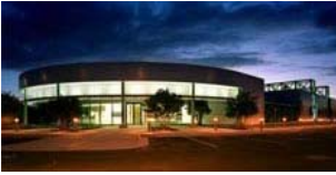
The Sid Martin Biotechnology Development Incubator is a leading resource for local and regional biotech startup companies.

INFORMATION THEORETIC LEARNING IS BASED ON LEARNING FROM EXAMPLES IN BIOLOGICAL AND ARTIFICIAL SYSTEMS, AND APPLYING THIS KNOWLEDGE TOWARD DEVELOPING LEARNING MACHINES.