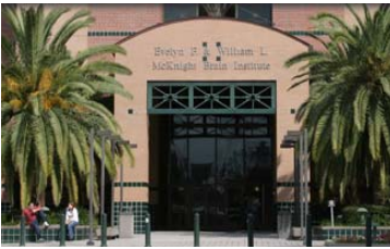
The McKnight Brain Institute is one of the partners involved in the proposed Center for Innovative Brain Machine Interfaces

The National Science Foundation's Partnership for Innova-